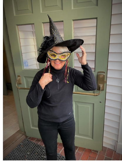
Two Caped Crusaders and a Dunford Dalmatian Puppy scamper across the All Saints front lawn